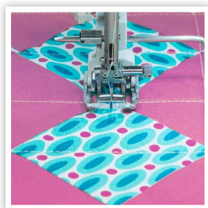
ACUFEED™ FLEX LAYERED FABRIC FEEDING SYSTEM