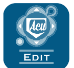
WIFI™ TECHNOLOGY AND 3 EXCLUSIVE JANOME APPS