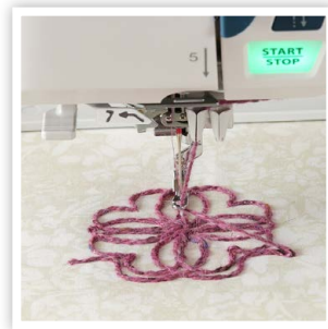
EMBROIDERY COUCHING FUNCTION