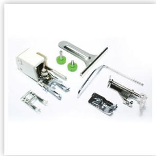
QUILTING SET INCLUDED