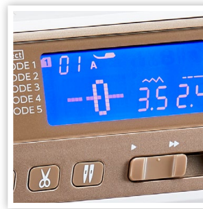
ENHANCED LCD SCREEN DISPLAY