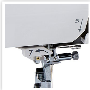
SUPERIOR NEEDLE THREADER WITH THREAD GUIDE 7